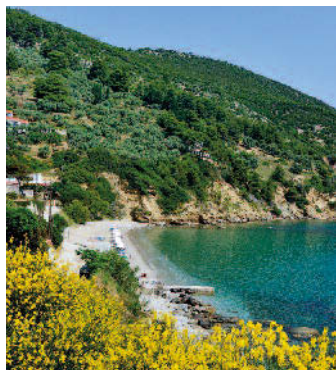
Glifoneri Beach near Skopelos Town

Self Catering and Bed & Breakfast Studios for 2/3 Apartments for 2/4 Swimming Pool Free WiFi